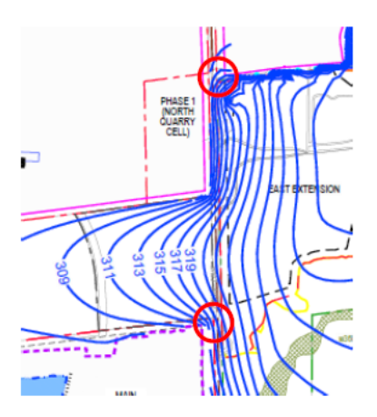
PHASE 1 NORTH OLARRY CELLI BAST EXTENSION

Approved existing quarry fully extracted – Approved existing quarry + MQEE fully extracted